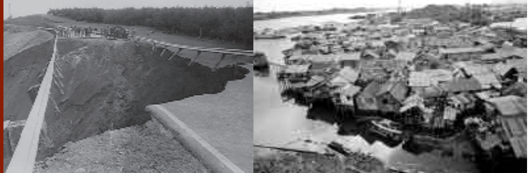
Low-lying settlements such as Tudor in Mombasa (above) are at high risk from even small rises in sea level

'Large areas of cities may become uninhabitable as a result of flooding or water-logging, or will be agriculturally unsuitable due to salt stress'