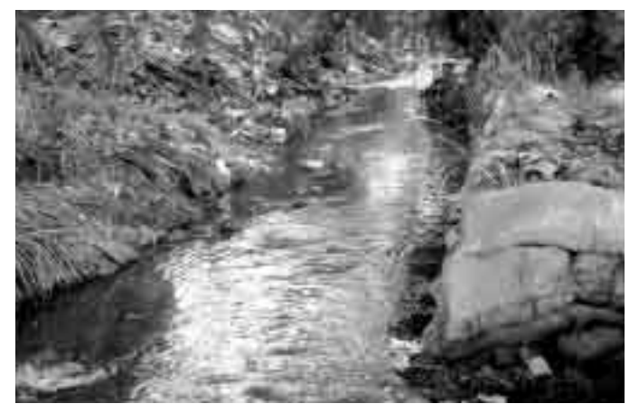
Drainage channels in developing-world coastal cities—like this one in Dar es Salaam—are frequently blocked, leading to flooding

Only two per cent of the world's land is in the Low Elevation Coastal Zone (LECZ) – the area adjacent to the coast that is less than ten metres above mean sea level – but this zone is home to ten per cent of the world's population, 60 per cent of whom live in urban areas.<sup>2</sup> Countries with long coastlines and sparsely populated interiors have a higher proportion of the population in these zones. Of the countries with the largest share of their population in the LECZ, all but two are low- or middle-income nations, making them particularly vulnerable to the effects of climate change. Continued urbanization is likely to draw more people into this zone. The low altitude of many coastal cities makes them highly vulnerable to flooding as a result of a rise in sea level, and also to tropical storms.