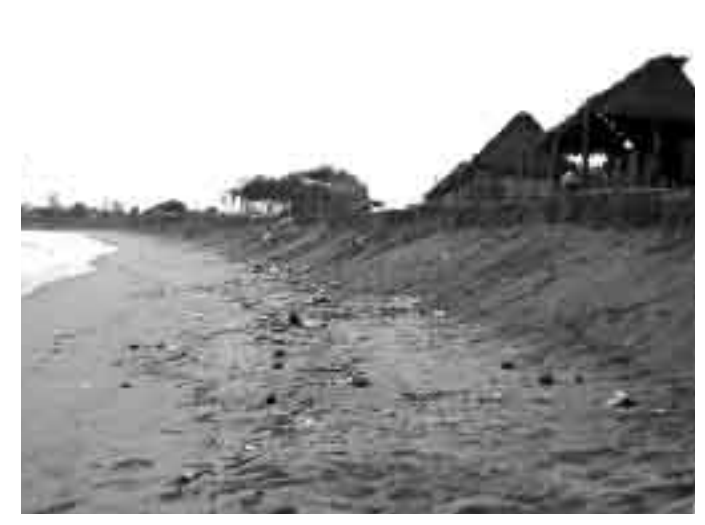
Fishing camps near Cotonou are threatened by coastal erosion

The main water pipeline serving Mombasa is old and leaks frequently. This further reduces the daily amount of water reaching the city. Renovation and improved management of the city's water and sanitation infrastructure is needed to serve the increasing water demand. This would stem the overexploitation of underground water that is exacerbating saltwater intrusion.