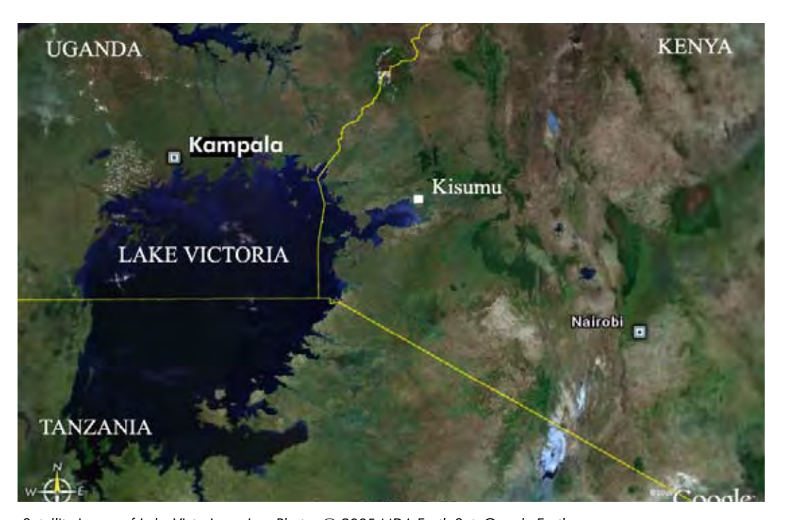
Satellite image of Lake Victoria region.

The dual administration of the city gave rise to contrasting types of urban development, the area around Kabaka's (King's) palace at Mengo led to the gravitation of Africans to that portion of the town where the more fortunate established town residences on privately owned mailo plots and where some individuals built houses on their land for the accommodation of largely people from other parts of Uganda2. The expansion eastwards led to the development of the slopes of Kololo Hill in the 1930s and 1940s while Makerere hill was added in 1938 for institutional purposes. In 1952, the 'African quarters' of Naguru and Nakawa were completed, established housing estates for low income earners. Kololo, Nakasero and Mbuya remained exclusive European residential areas until after independence in 1962.