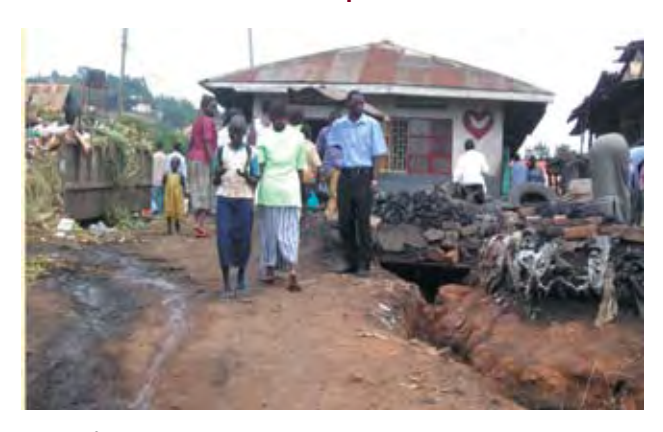
Poor infrastructure.

The emergency of slums in Kampala City has been gradual and sustained over a long period of time, a combination of factors have contributed to this growth, some of them discussed below: