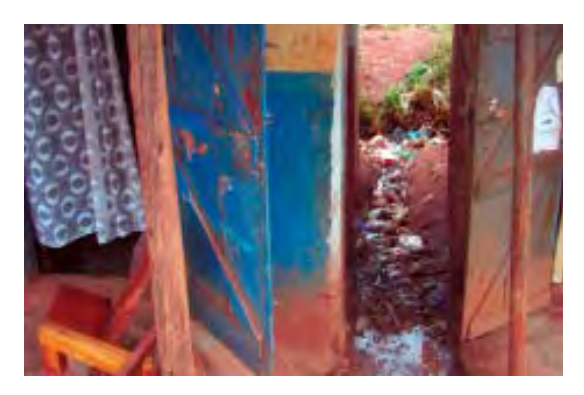
Poor drainage.

The responsibility of physical and urban planning was decentralised by the Local Government Act, 1997 which requires urban authorities to regulate and control population activities in respect of housing construction and settlement; manage parks and open places; etc. in conformity with the Local Governments Act, 1997, the Town and Country Planning Act, 1964, and the Property Rates Decree 1977 (which is currently being reviewed for amendment) among others. Decentralization of the function of physical planning caught the local governments (including Kampala City Council) unprepared as such they have failed to cope with the challenges of rapid urbanisation basically caused by the rapid population growth. The ideal situation should have been that services are provided and cited according to approved development and the structure plan. Slums in Kampala are not only for the poor, but for the rich as well (rich man's slums) where settlement is unplanned and the areas are un-serviced. Failure to enforce laws aimed at ensuring progressive and planned urban land development, poor coordination, corruption, mixing of urban management with politics and the laxity in enforcement mechanisms, largely account for the growth of slums in Kampala city.