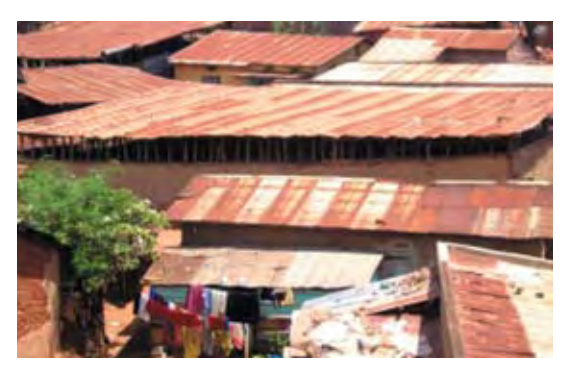
Rooftops in the slums.

certain types of tenure easily support planned development on land while others work to the detriment of orderly growth. Since the abolition of statutory leases by the 1995 Constitution, Kampala City Council lost its 199 year lease; the land reverted to customary owners. Majority of the slums are now currently on private mailo (such as Kagugube) or on former public land which customary tenants have taken over as owners due to the abolition